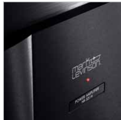
Elegant black anodized aluminum finish