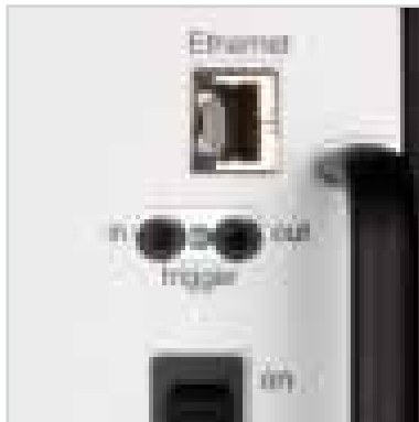
Ethernet and 12V trigger controls